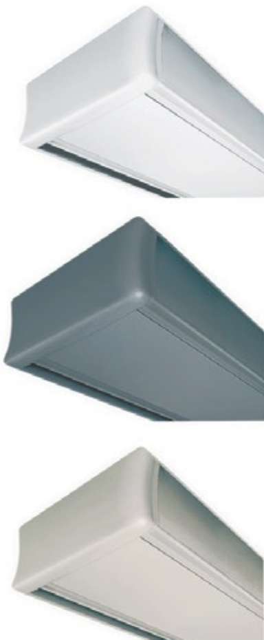
Different colour finishes