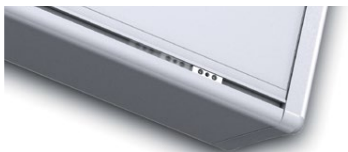
(*) Adjustable fixing points through guide rail