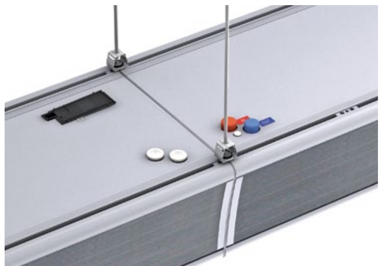
Joining two units